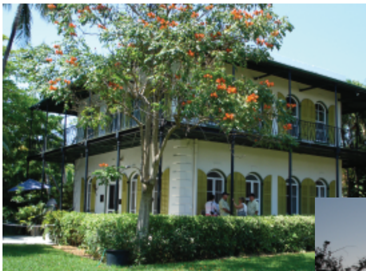
Hemingway Home houses the authoring studio gardens and polydactyl tea

While the sand of Key West's beaches is imported, everything else about the island is uniquely local, from its storied history to its brilliant sunsets. The southernmost point in the continental United States has retained its allure as a relaxed beach community by day that transforms into a lively scene on Duval Street at night.